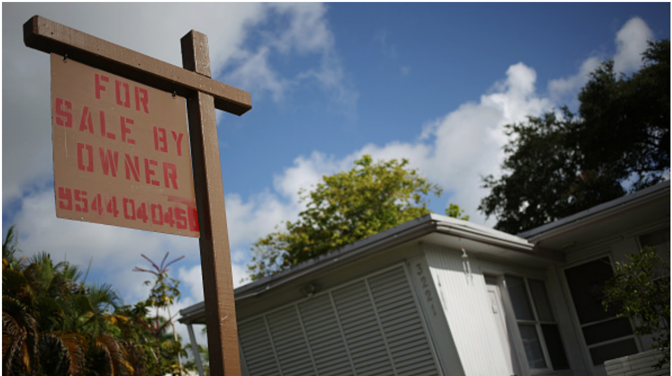
( https://newsaf.cgtn.com/news/2020-11-18/U-S-household-debt-rises-above-pre-Covid-19-levels-due-to-mortgages-VvjJJTcxq/index.html )