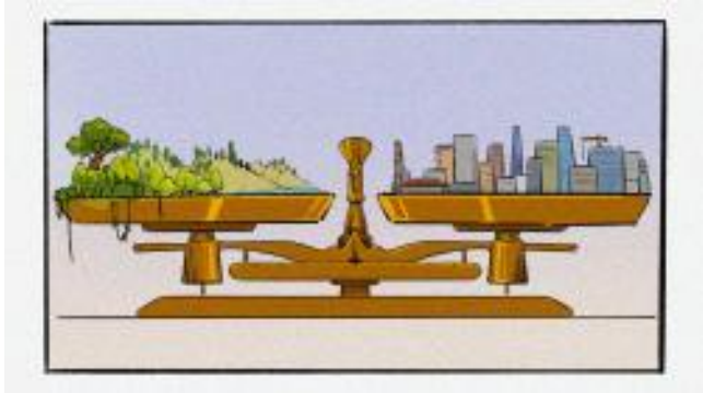
( https://news.cgtn.com/news/2020-11-04/Balancing-green-and-grey-V4nXIE62Ws/index.html )